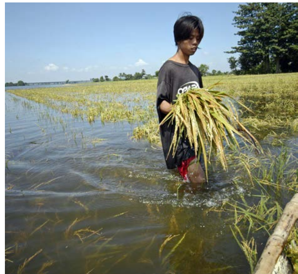
Flooded rice fields - Photo credit Nonie Reyes/ World Bank

accessing such insurance coverage and decided to partner with the World Bank to design a customized approach.